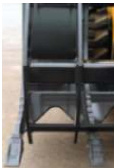
Gusseted between teeth for added strength.