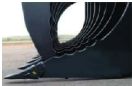
Unique serrated edges provide grip to keep items from rolling out.