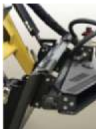
Torsion Suspension System